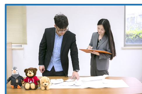
Step 6: Review & Reform.