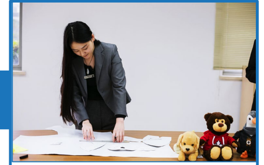
Step 1: Design/Draw Pattern.

This is the story of how an idea is turned into a physical sample in a matter of just 3 days. No photo or drawing to give us? No problem. Here's how we do it.