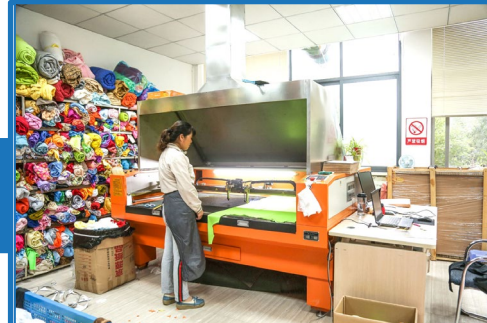
Step 3: Cut the Pieces.