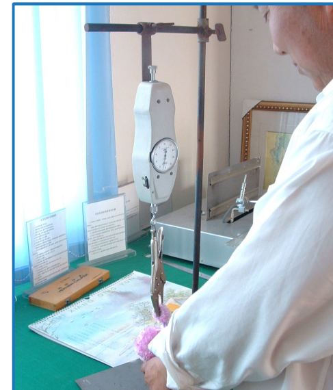
Step 7: QC & Safety Review.