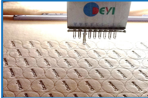
Step 4: Embroider, if Required.