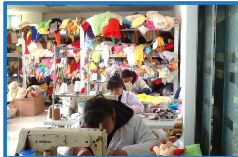
Step 5: Sew Together & Stuff.

This is the story of how an idea is turned into a physical sample in a matter of just 3 days. No photo or drawing to give us? No problem. Here's how we do it.