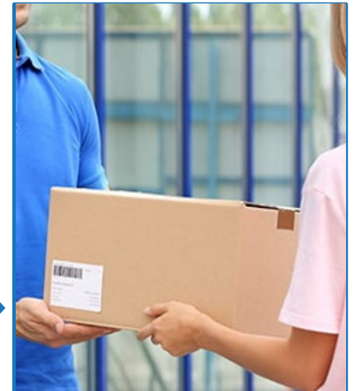
Shipped to Your Door